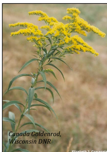
Canada Goldenrod, Wisconsin DNR

The tables below are adapted from several "Plant Materials Technical Notes" available from the New York State Natural Resources Conservation Service. Table 1. lists a variety of native, introduced, cool- and warm-season grass species recommended for grassland conservation in New York. It is recommended that seeds be sown utilizing a mixture of three to four species from this list.