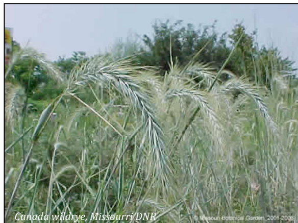
Canada wildrye

Created for the Greene Land Trust's Community Grassland Stewardship Project