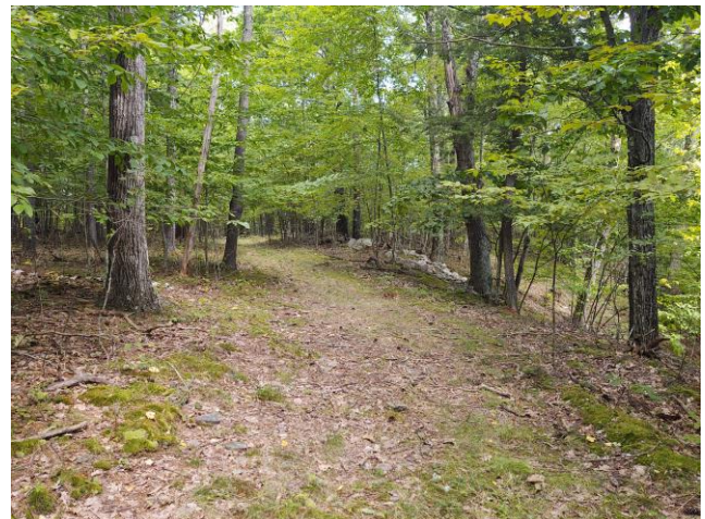
View of forest at Doris Duke Preserve at Round Top

In October 2020, the Green Land Trust was pleased to accept a perpetual conservation easement on 76 acres in Cairo, New York from the Stephen Petronio Dance Company, Inc. with financial support from the Doris Duke Charitable Foundation.