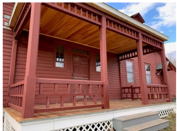
Completed porch ceiling at The Willows which is the new location of the Greene Land Trust’s Office.