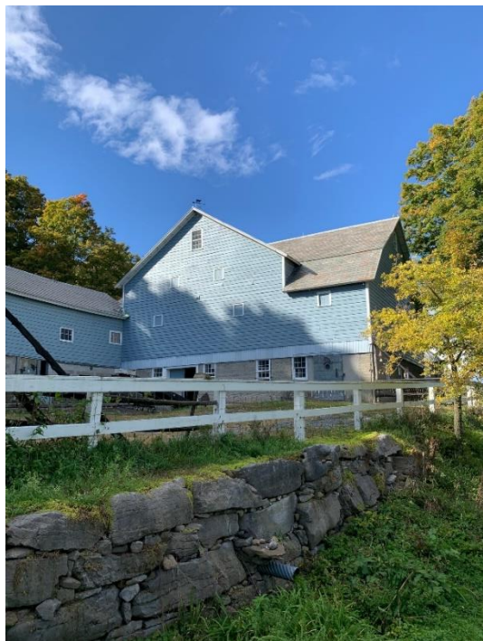
Flegel Farm protected by conservation easement donated to the Greene Land Trust