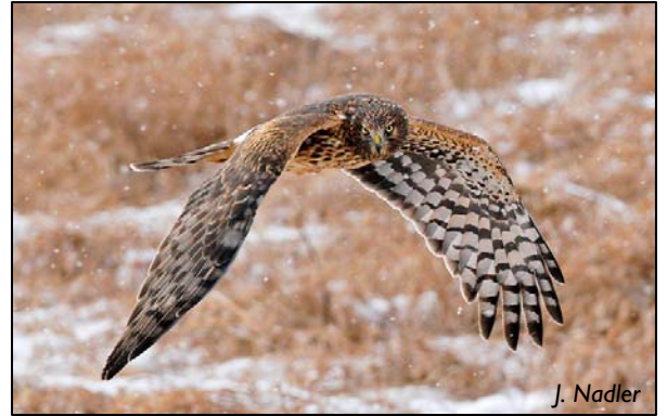
The Northern Harrier flies low over fields searching for food.

This hawk is listed as a Species of Greatest Conservation Need and as Threatened in New York State, and as a species of Regional Concern by Partners in Flight in Bird Conservation Region 13. Breeding Bird Atlas data indicate a slight increase in breeding areas in the Hudson River Valley in the past 20 years.