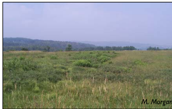
Grassland habitat in NY

This management summary is adapted from Dechant et al. 2003, NatureServe 2008 and Vickery 1996.