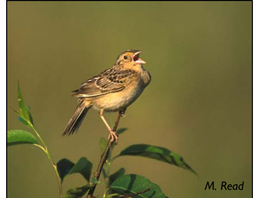
The Grasshopper Sparrow uses elevated perches for singing.