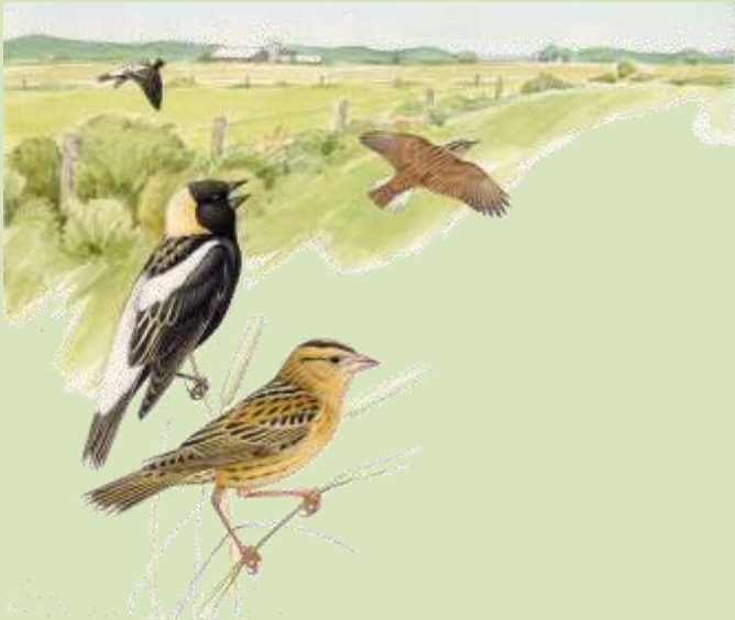
Male and female Bobolink