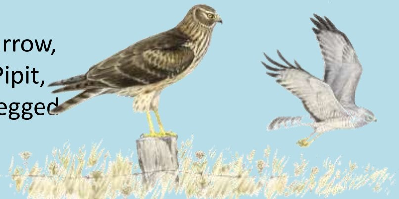
Northern Harrier pair

• Other grassland bird species: Savannah Sparrow, American kestrel, Snow bunting, American Pipit, Lapland longspur, Eastern Bluebird, Rough-legged hawk